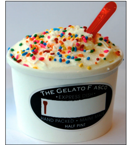
An Express Dish opened and served with a red spoon.