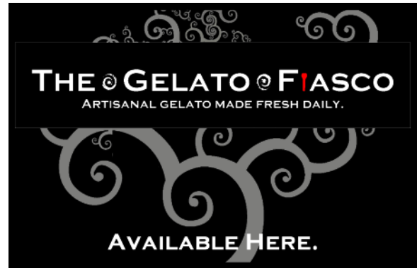
POINT-OF-SALE WINDOW CLING

We can help you create a stunning visual display with materials that will help entice customers.